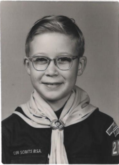
SCHOOL DAYS 1955-56 ORANGEWOOD