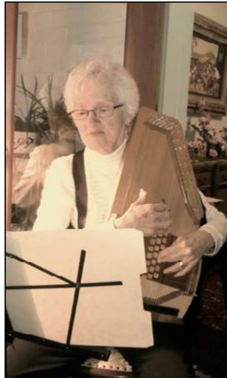
Two of the musicians and their autoharps.