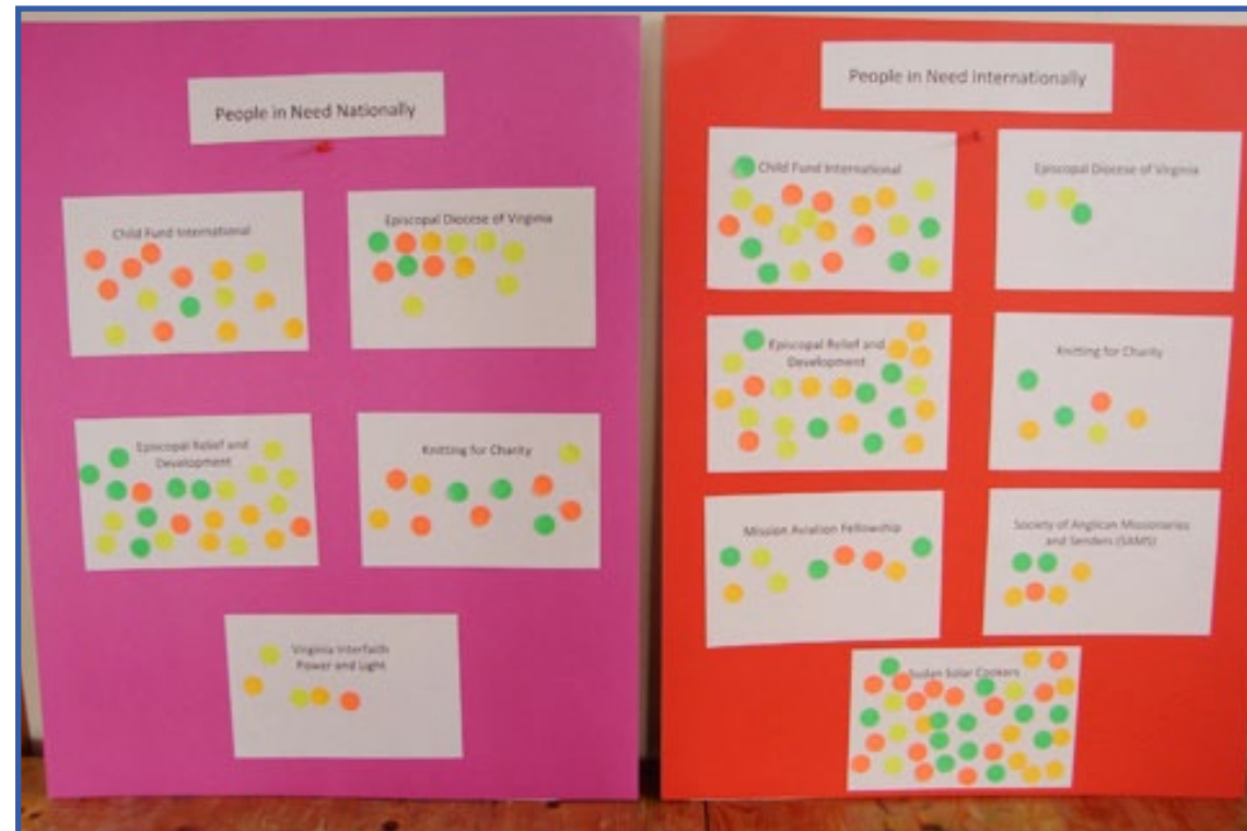
The results are in: stickers were used to indicate interest in the various ministries that are currently supported by time and treasure.